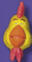
CHICKEN “Don't make me get all McNugget on you!”