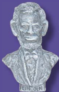
LINCOLN “Four score and seven years ago...”