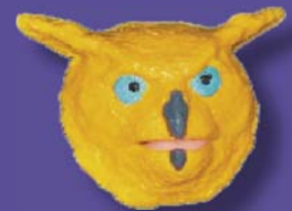
OWL “HOO's your daddy?”