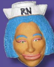
NURSE “I can hold your thermometer ...oral only, please.”