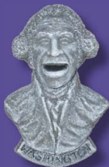
WASHINGTON “Arbitrary power is most easily established on the ruins of liberty abused to licentiousness.”