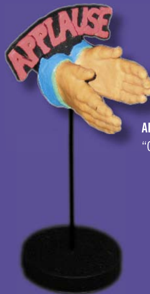
APPLAUSE “Clap, clap, clap”