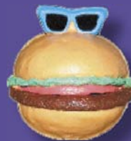
BURGER “Dude, where are the fries?”