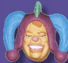
JESTER “Hey, what's that on your shirt?”