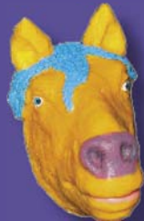
HORSE “Why the long face?”