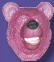
BEAR “Put me next to the honey jar”