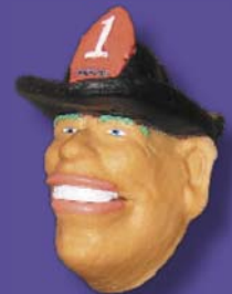
FIREMAN “Is it getting hot in here?”